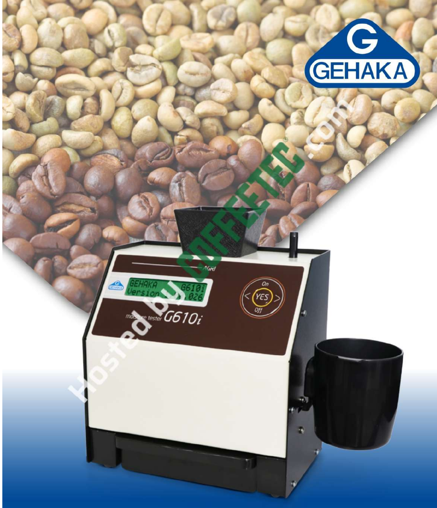
Portable grain moisture meter G610i